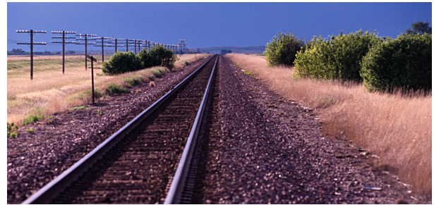
RR Tracks Second in Transportation Category August 9, 2010

Dec. 13. View Members' Images from Fall Foliage Field Trip. Also, the presentation of a Radiant Vista "How-To" video.