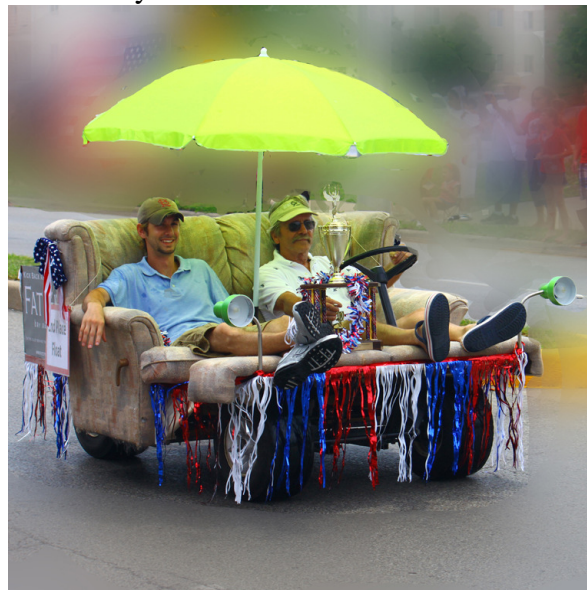
Sofa Cycle Second in Humor Category August 9, 2010

For everyone's convenience, the rules for the Challenge, unchanged from 2010, appear at the end of this newsletter. The KodaRoamers may wish to make a change. If so, we'll let you know early in the fall.