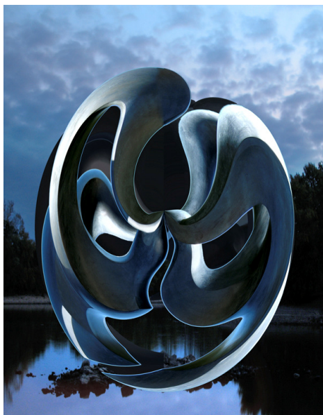
Spectre © 2010 Jean Paley First Place in Abstract Category July 12, 2010