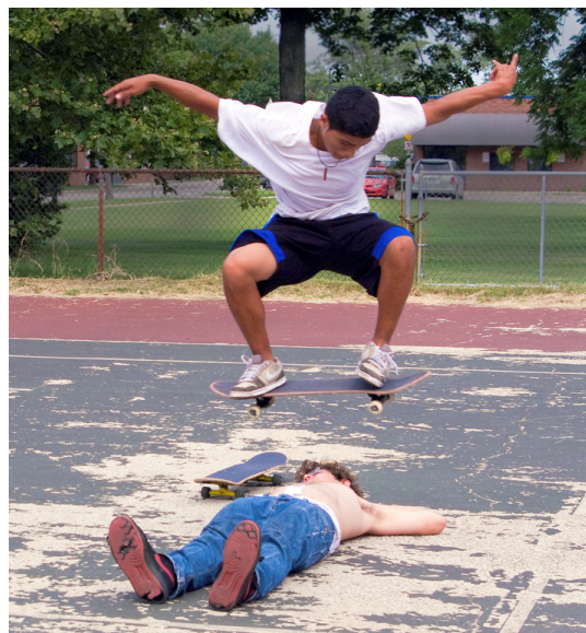
Buddy Jump © 2010 Gail Snowdon First in Action Category August 9, 2010

October 11. Select images for CICA Fall Club Salon. The Club may submit up to 50 images consisting of digital images and/or slides across all four of the new CICA categories with no person allowed to submit more than eight regardless of the number of clubs through which that person is submitting such images. The Club may also submit up to 50 images in the Small and Large Monochrome categories together, and likewise for the Large and Small Color categories. The same eight image limit applies to the two major print subdivisions.