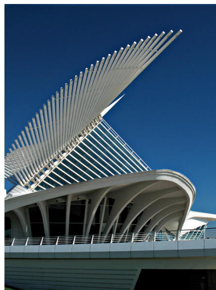
Milwaukee First Place in Architecture Category July 12, 2010

there has been discussion within the Club that we should adopt the new CICCA definition of Photo-Realistic, in which case blending of images would be permitted. This question should be decided well before our next competition. In the program, non photo-realistic categories will be designated NPR.