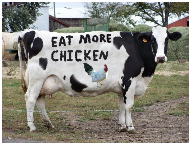
Farm Bulletin Board First in Humor Category August 9, 2010