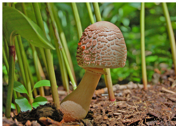
Marc’s Mushroom © 2010 Ray McCormack Second Place in Flora Category July 12, 2010

August 23. View Members’ Images applying Radiant Vista Techniques presented at June 7 meeting (surreal images). Please bring two different images with before and after surreal technique applied of each image (four total).