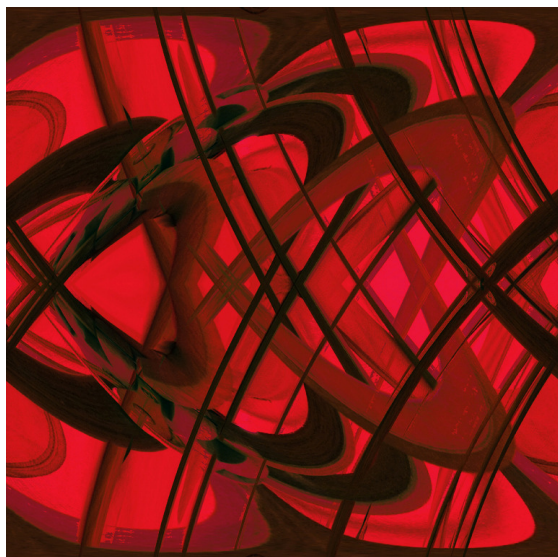
Rings Second Place in Abstract Category July 12, 2010

(Re)Acquainted Night. Bring up to 15 images (preferably digital, but prints are also welcome) to share with others. (Note the reduction from 20 to 15).