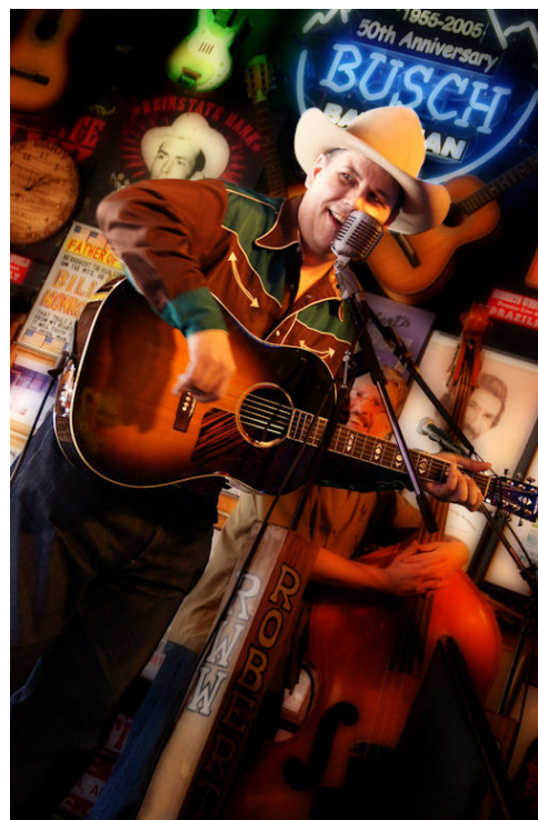
Honky Tonk'N Second Place in People Category October 4, 2010

Dec. 13. View Members' Images from Fall Foliage Field Trip. Also, the presentation of a Radiant Vista "How-To" video.