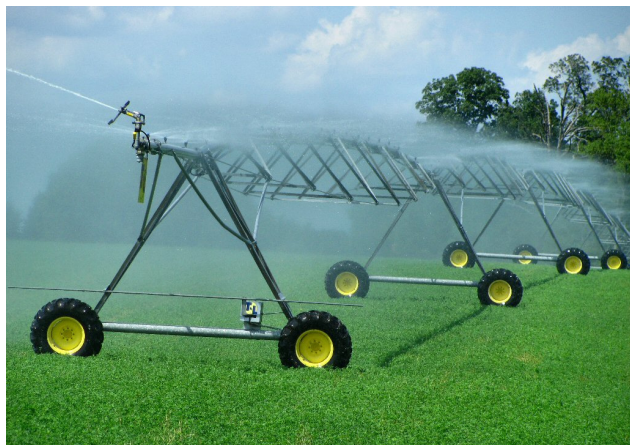
Irrigating the Fields Fourth in Water Category October 4, 2010

Feb. 21. Educational Session on members' questions and issues, and also a viewing of members' images applying Radiant Vista techniques demonstrated on December 13.