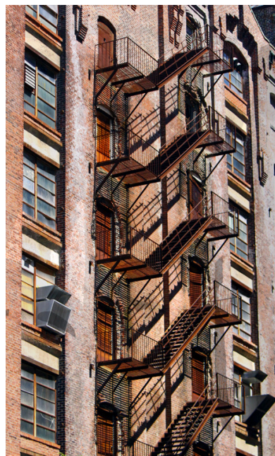
Urban Fire Escape Second in Urban Category October 4, 2010

May 2, 7PM. Annual Business Meeting; selection of images for I-74 Challenge and topic for next year's I-74 Challenge; and plan our program for the next Club year.