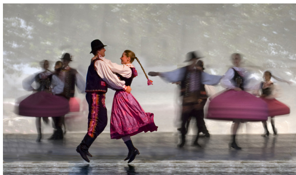
Old World Dancers Medallion winner, Photorealistic November 6, 2010