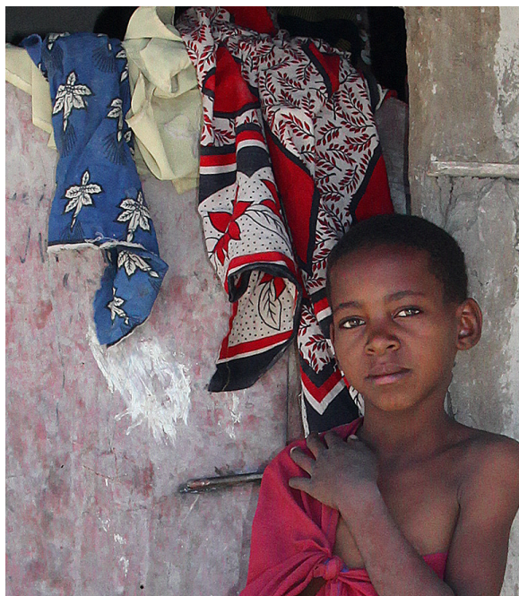
Massai Boy