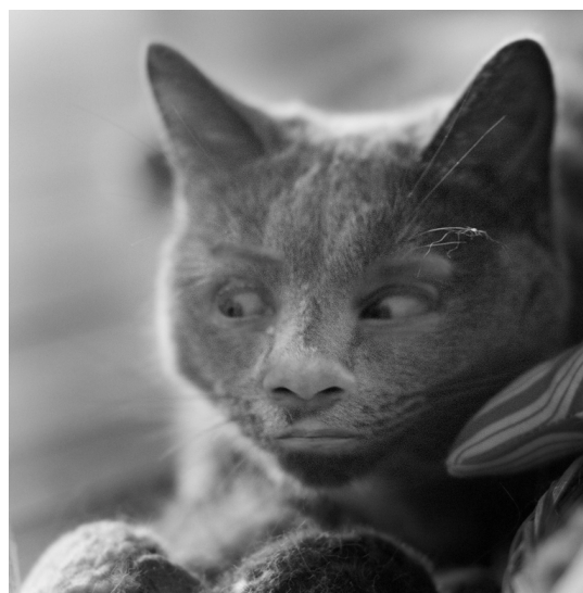
Hmmm

FRIDAY, May 11 I-74 challenge – The Closer, The Better . Hosted by KodaRoamers