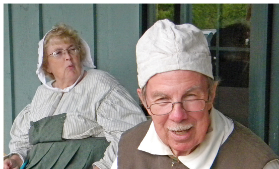
Pioneer Couple

Larry Kanfer has offered to conduct a three hour workshop for camera club members if at least 20 people sign up. The cost is $50 per person. Members at the September 13 meeting expressed interest in attending the workshop if it is held in September 2012. Charissa Lansing will work with Larry Kanfer's staff on scheduling the workshop.