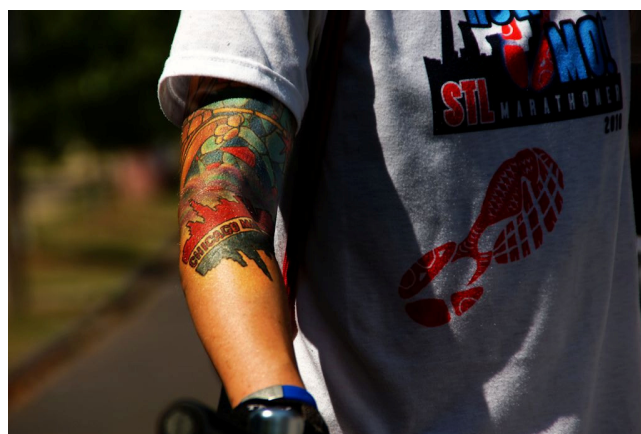
Arm Art