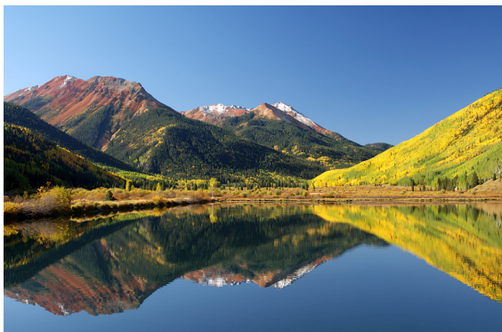
Rocky Mountain Reflection

Please refer interested amateur photographers to the Camera Club website for an entry form. Entry forms can also be downloaded from The Urbana Park District and the News-Gazette websites. Many thanks to club members who posted BIS posters and passed along entry forms to friends.