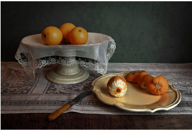
Citrus and Lace © 2011 Chris Main

The schedule is subject to change, although generally few changes have been made to the schedule. We will meet in Turner Hall. All meetings are on Monday evening and begin at 7:30 pm unless otherwise noted.