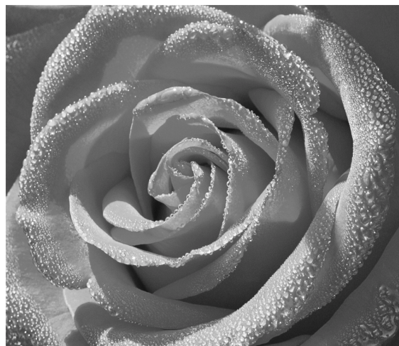
Kissed with Dew