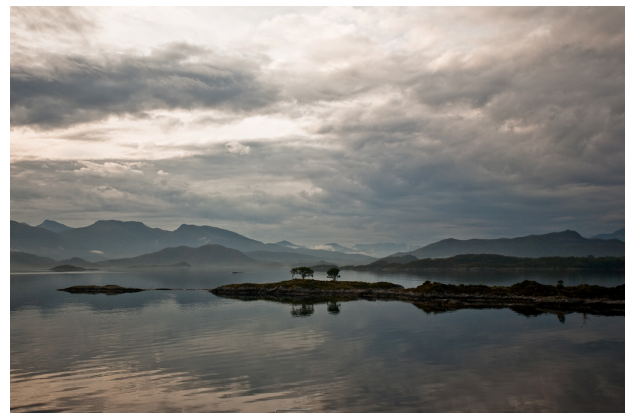
Reflections along the coast of Norway