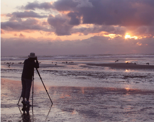
Oregon Sunset