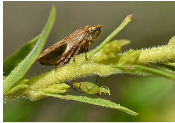
Hopper 9112011