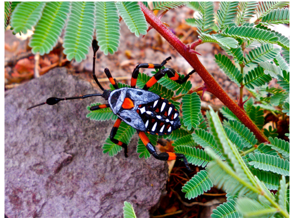
Mesquitebug Nymph