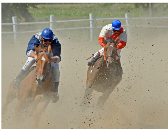
Rounding the West Turn