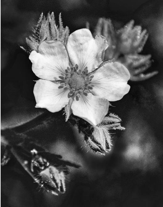
Wild Rose