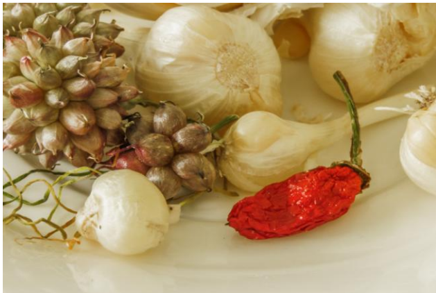
Garlic & Pepper