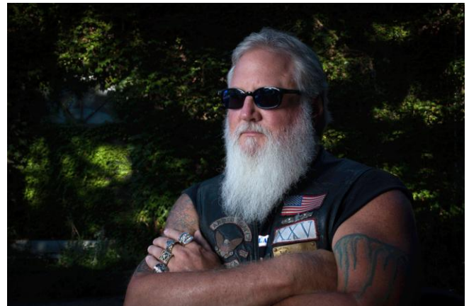
Bad Brad

Jan 9 Mounting Prints Workshop/Presentation. Member Show. More information to follow.