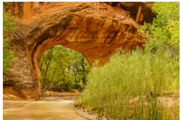
Coyote Gulch Arch

Mar 26 Projected Image Competition. A People (O) B Creative/Contemporary – Surprising Perspectives C I-74 Challenge Subject (PR) –Social Interaction