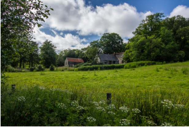
Scottish Meadow